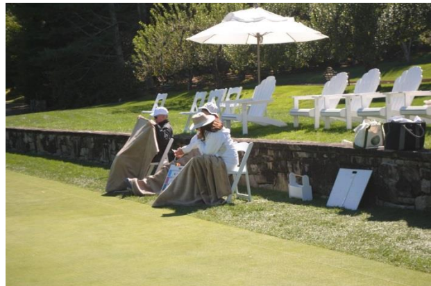
Keeping the deadness boards